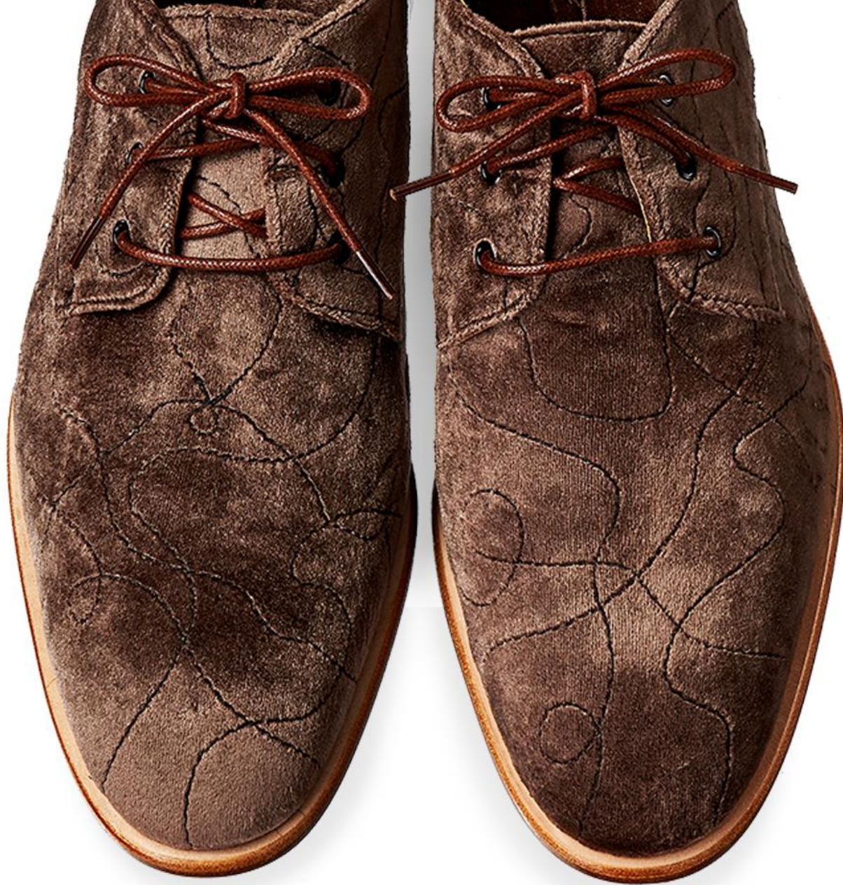
MODEL EDWARD M1170 COLOR BROWN