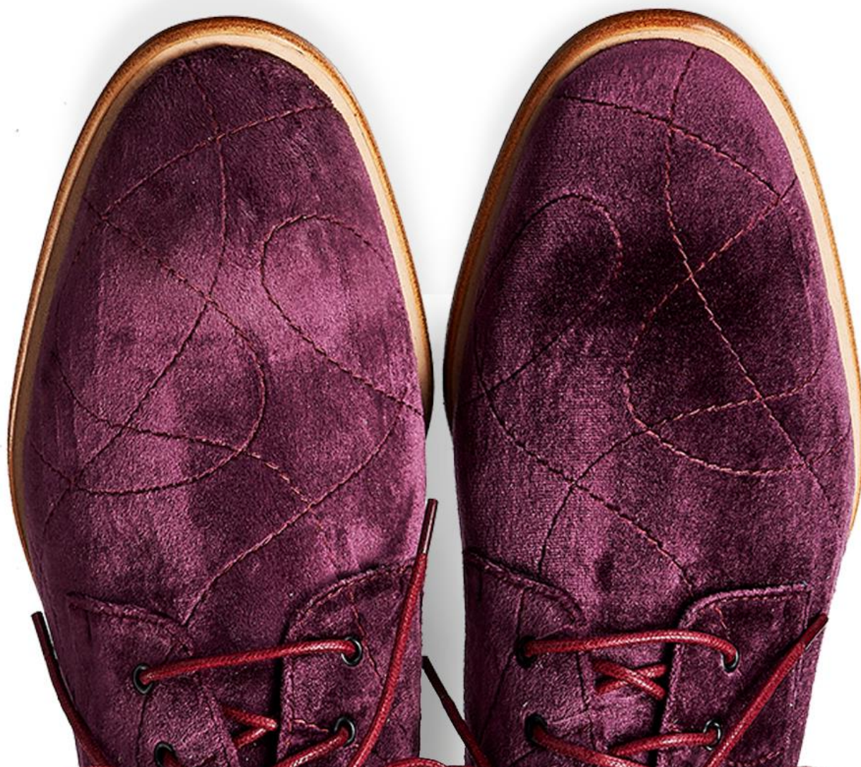
MODEL EDWARD M1170 COLOR PURPLE